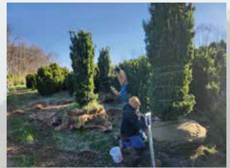
Digging 8-foot-tall Taxus 'Hilli' at Jackson's Nursery

When you next visit Yew Dell, check out the new dwarf Hicks yews and take a minute to reflect on the 30 years of tending, weeding, watering, and care that was their long and winding road to their new garden home.