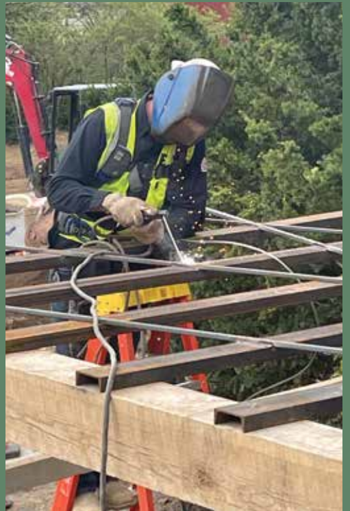
Our Oldham County neighbors at East & Westbrook Construction fabricated and installed custom steel railing work and finishing touches on the three monumental arbors.