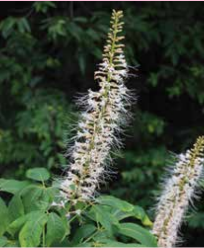
Millstone Garden Bottlebrush Buckeye ( Aesculus parviflora )