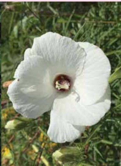
Rain Garden Neches River Rose Mallow ( Hibiscus dasycalyx )