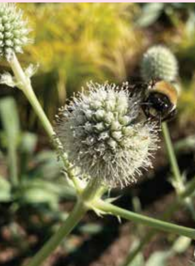
Parking Lot Rattlesnake Master ( Eryngium yuccifolium )