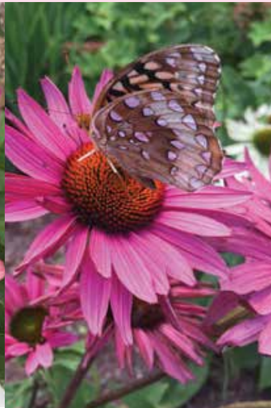
Parking Lot Purple Coneflower ( Echinacea purpurea )