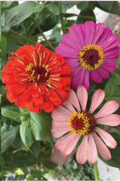
Next to the Log Cabin Cut Flower Garden