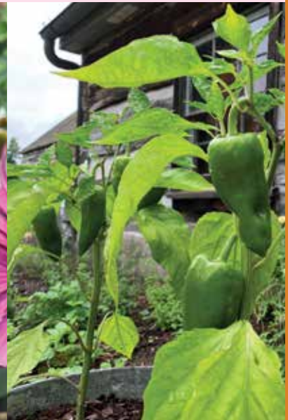
Log Cabin Herbs and Vegetables in the Edible Garden