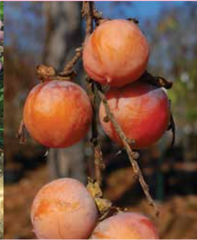
Arboretum South Persimmon ( Diospyros virginiana )