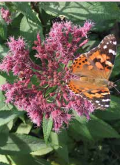
Parking Lot Joe-Pye Weed ( Eutrochium fistulosum )