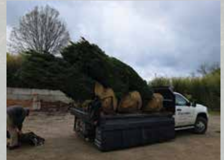
This is what more than 240 years of total growth in a nursery row looks like.