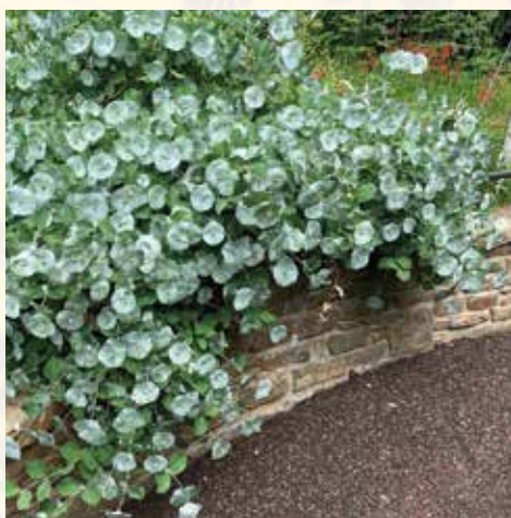
Kintzley's Ghost honeysuckle will be featured on one of the Castle Gardens monumental arbors.