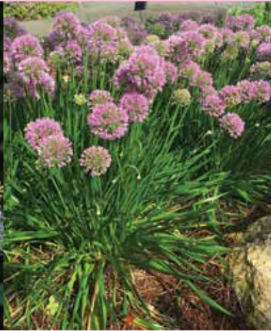
Rounsavall Pavilion Garden Ornamental Onion ( Allium 'Millenium' )