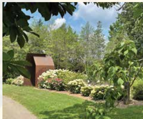
Even more hydrangeas being added to the shrub evaluation garden in 2025.

Hydrangeas, butterfly bushes ( Buddleia ), honeyberry ( Lonicera caerulea ) selections, red hot pokers ( Kniphofia ) and more . . . But it's time for a change.