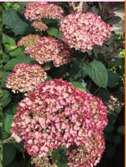
Shrub Evaluation Garden Smooth Hydrangea ( Hydrangea arborescens )