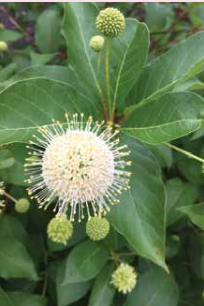
Rounsavall Pavilion Garden Buttonbush ( Cephalanthus occidentalis 'Kolmoon' )