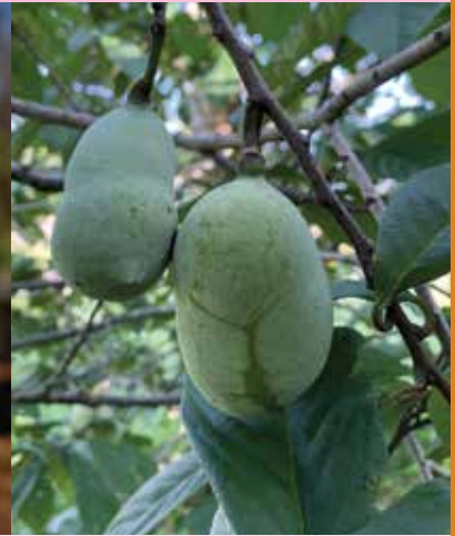
Arboretum North Pawpaw ( Asimina triloba )