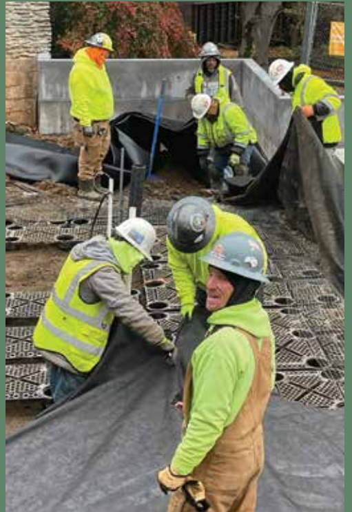
EZ Construction Inc., did brilliant work as the project general contractor, making sure every detail was perfect.