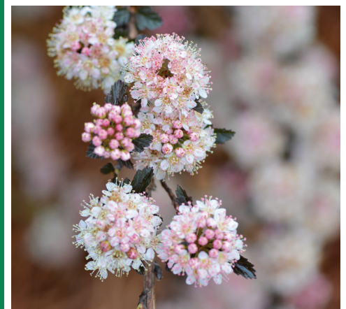
Dwarf Nine Bark

Stunning 20-30'-tall, broad spreading tree with attractive, horizontal branching. It is prized for its early summer, creamy white blooms that attract a wide range of pollinators and its excellent red/maroon fall foliage. Fall blue/black fruit are attractive to many birds. Grows best in full sun or part shade.