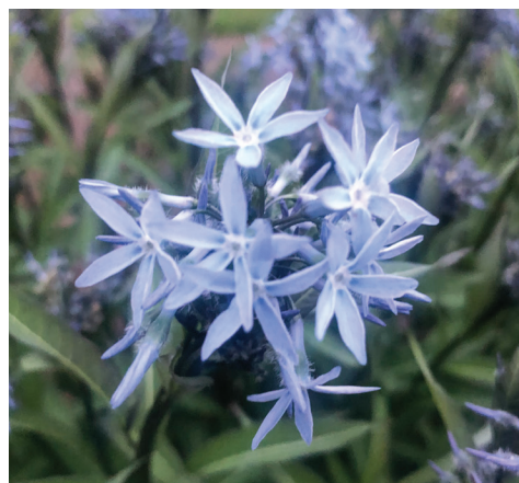
Blue Star Amsonia

Diverse group of low growing, sculptural, compact evergreens maturing at 3' to 8' depending on cultivar. Many varieties available with either bright or dark green or bright gold foliage. Best in full sun or light shade. Useful as a featured specimen, container plant, or in as a rock garden specimen.