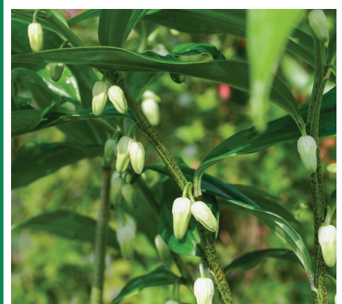
Evergreen Solomon Seal

Native North American sun plant that forms dense masses of erect stems to about 3' tall, topped with sky blue flowers in spring. 'Storm Cloud' is a very vigorous form with deep, almost black stems and heavy flowering. Best in full sun and well-drained soil.