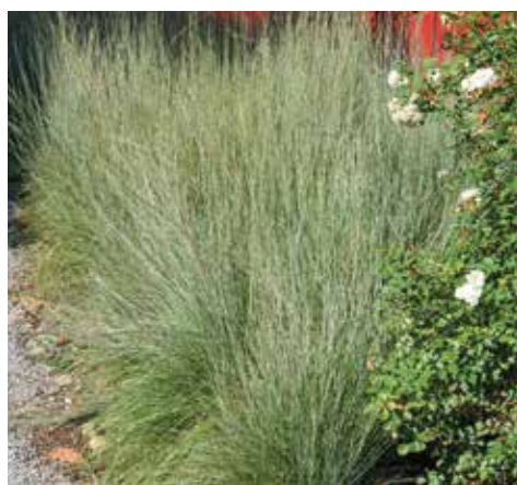
Little Blue Stem Schizachyrium scoparium 'Standing Ovation'

Uncommon 60'-tall evergreen with a loosely upright outline. Fine textured, four to five-inch-long, blue/green needles provide a soft feel to the entire plant. Plant in full sun in all but very dry or very wet soil and it will reward with years of mostly trouble-free growth.