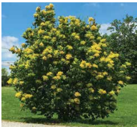
Peking Lilac Syringa reticulata subsp. pekinensis Great Wall® ('WFH2'), Beijing Gold™ ('Zhang Zhiming')

A durable, 35'-tall Asian species best known for masses of white, fragrant flowers in early summer, and mahogany-colored, peeling bark. At home in any reasonable soil and full sun. Beijing Gold™ offers creamy yellow flowers while Great Wall® was selected for upright, uniform growth and vigorous bloom.