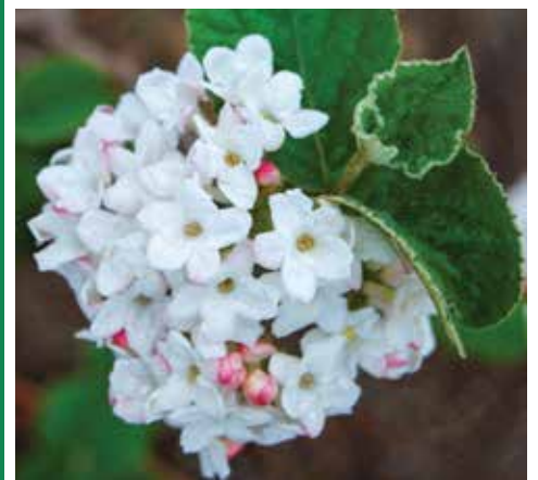
Korean Spice Viburnum Viburnum carlesii 'Select S' (Sugar 'n Spice™), 'Compactum', 'Aurora'

This late-blooming hybrid of a Kentucky native tree explodes with fragrant spring blooms of yellow with pink/green highlights after most frost danger. Growing to 40' tall, it forms a uniform, upright specimen with distinctive gray bark. Plant in full sun and water through dry spells.