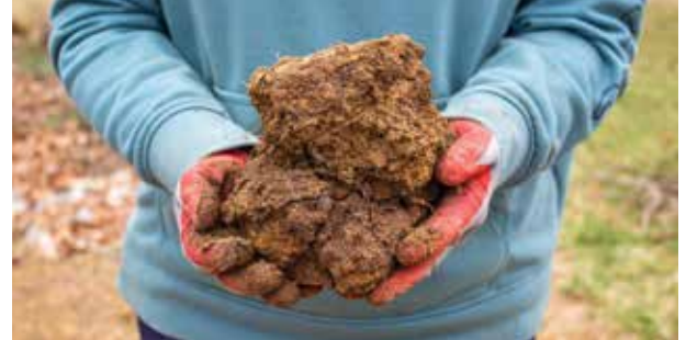
Clay soil that many gardeners see in their yard.

Our horticulturists and the Klein family alike have been fighting this same soil since the establishment of Yew Dell Farms in the early 1940s. A patchwork landscape of soil structures exists in the gardens now. In some areas, the soil is dense orange clay. In others, you hit limestone inches below the surface. This story rings true for many gardeners and often requires the soil to be built back up with amendments. Amendments can be added with composts made with composted manure, leaves, or fine pine bark.