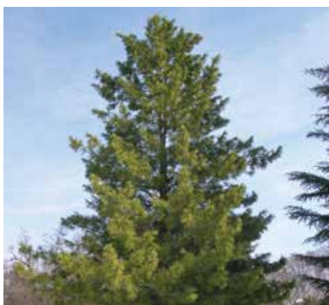
Korean Pine Pinus koraiensis

Dense 4'-6' shrub prized for fragrant spring flowers that start pink/red in bud and open to white. Fuzzy, green summer foliage turns to wine/red/orange in fall. Drought tolerant and easy to grow. Notable selections include 'Compactum' (3'-4'), 'Aurora' (deep red buds) and Sugar 'n Spice™ (heavy flowering.)