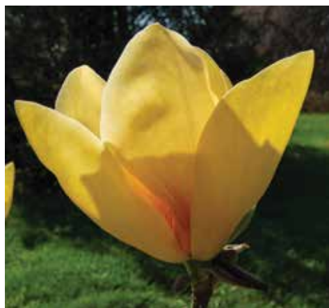
Hybrid Magnolia Magnolia 'Sunsation'

A durable, 35'-tall Asian species best known for masses of white, fragrant flowers in early summer, and mahogany-colored, peeling bark. At home in any reasonable soil and full sun. Beijing Gold™ offers creamy yellow flowers while Great Wall® was selected for upright, uniform growth and vigorous bloom.