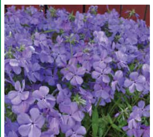
Woodland Phlox Phlox divaricata 'Blue Moon', 'May Breeze'

Outstanding, 3'-4'-tall native grass forms erect clumps of blue/green foliage, turning blue/purple in fall. Clouds of wispy seed heads top the plant in late summer and fall. While many Blue Stem forms have a hard time standing up in the garden, 'Standing Ovation' stands tall.