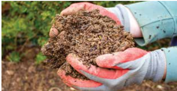
Soil with compost added for a new display garden.

While you don't need to get out that rototiller every year, it is important to mix these amendments initially to ensure your time and money don't run off in the next heavy rainfall. Plus, mixing the existing soil with the compost encourages soil microbes and microorganisms to spread throughout, improving the soil structure overtime. Improved structure means access to better drainage, proper aeration, and increased area for nutrient uptake giving way for happy roots.