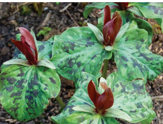
Sweet Betsy Trillium cuneatum

If you are looking to add spring ephemerals to your garden, Autumn is the perfect time to plan out your botanical designs. Trilliums, Bloodroot, Anemone, Virginia Bluebells, among others – are also in our bare root bunker. These plants are known for their sudden bursts of abundance and color in early spring, benefiting from the sunlight that is readily available until the trees above leaf-out once more. Planting such bare root rhizomes or bulbs into the soil in the Fall gives them a head start prior to their spring emergence. Just make sure to plant spring ephemerals in a mostly shady area under deciduous trees (those whose leaves fall), not evergreens.