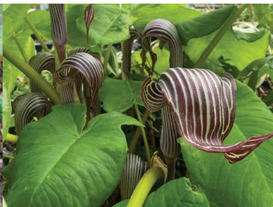
Farge's Cobra Lily Arisaema fargesii