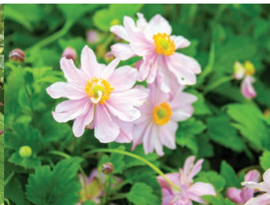
Japanese Anemone Anemone hupehensis 'Pocahontas'