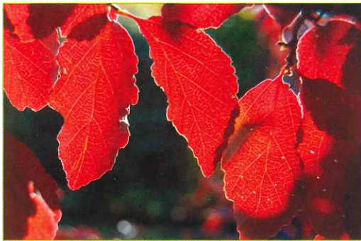
Chinese Ironwood ( Parrotia subaequalis )