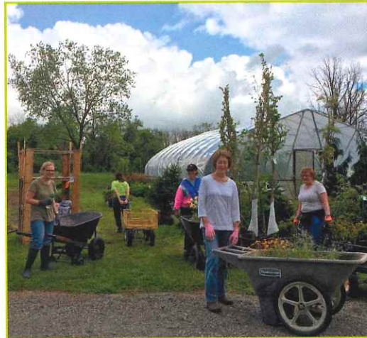
Volunteers hard at work organizing plants for the Plant Sale!