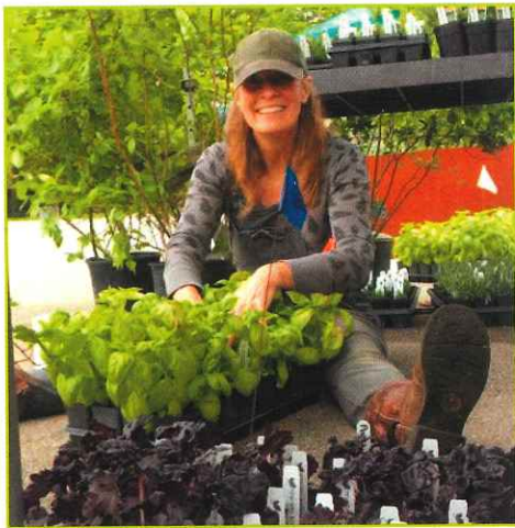
All smiles setting up for the Annual Plant Sale!