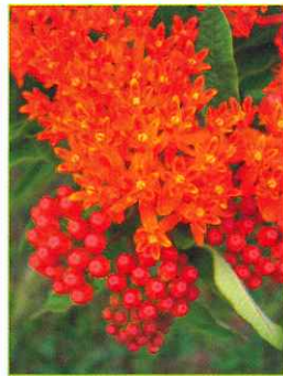
Milkweed ( Asclepias species )