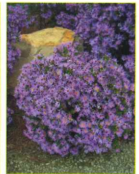
Fragrant Aster ( Aster oblongifolius )

Yew Dell's plant mission is to collect and test as wide a variety of plants as we can get our grubby little gardener's hands on – put them through the wringer and then bring you the best of the best. So here is a sampling of some of our favorites for 2018.