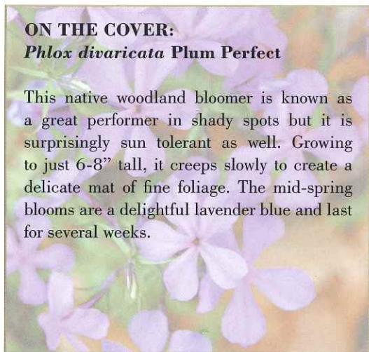
ON THE COVER: Phlox divaricata Plum Perfect

This native woodland bloomer is known as a great performer in shady spots but it is surprisingly sun tolerant as well. Growing to just 6-8" tall, it creeps slowly to create a delicate mat of fine foliage. The mid-spring blooms are a delightful lavender blue and last for several weeks.