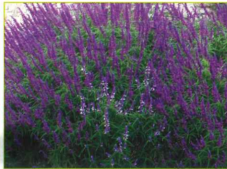
Mexican Sage ( Salvia leucantha )