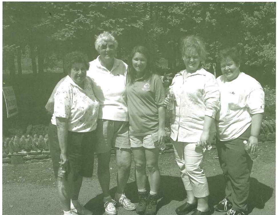
Members of the Ramblers Garden Club, who have adopted the Secret Garden, worked tirelessly in the garden mowing the more than 70 hellebores, 100 hardy ferns, and dozens of shade plants that adorn the newly planted garden.

Thanks for helping us keep it in tip top shape.