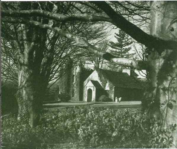
The Castle at Yew Dell

With the recent "Landmark of Excellence" award bestowed to Yew Dell Gardens for its membership campaign, now is the time to ask, "Are 'Yew' A Member?"