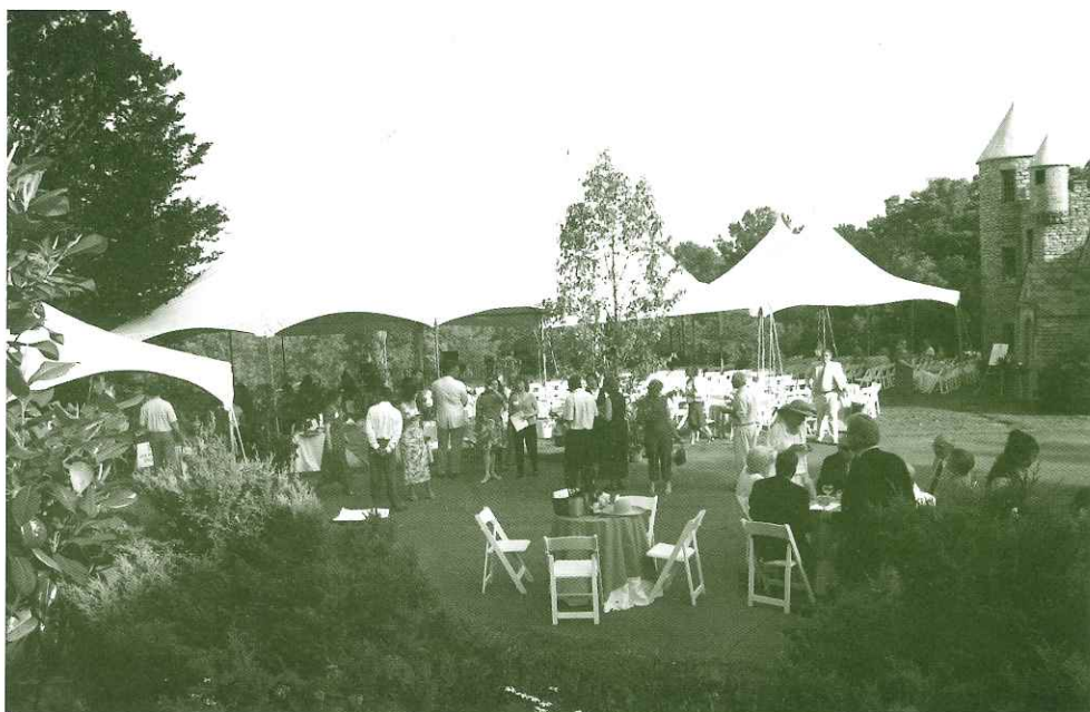
Yew Dell Gardens was bustling with festive flair during the opening gala celebration on June 11. This view is from the top of the terrace overlooking the Castle and meadow.

Please know we are so grateful for the generous support of everyone who attended or purchased items at the gala and open house. Donors names that are published in this issue of our newsletter represent direct donations to the ongoing capital campaign, new members and in-kind contributors. If we have missed or misspelled your name, please call our office at 502-241-4788. We apologize for any errors.