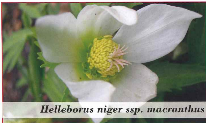
Helleborus niger ssp. macranthus