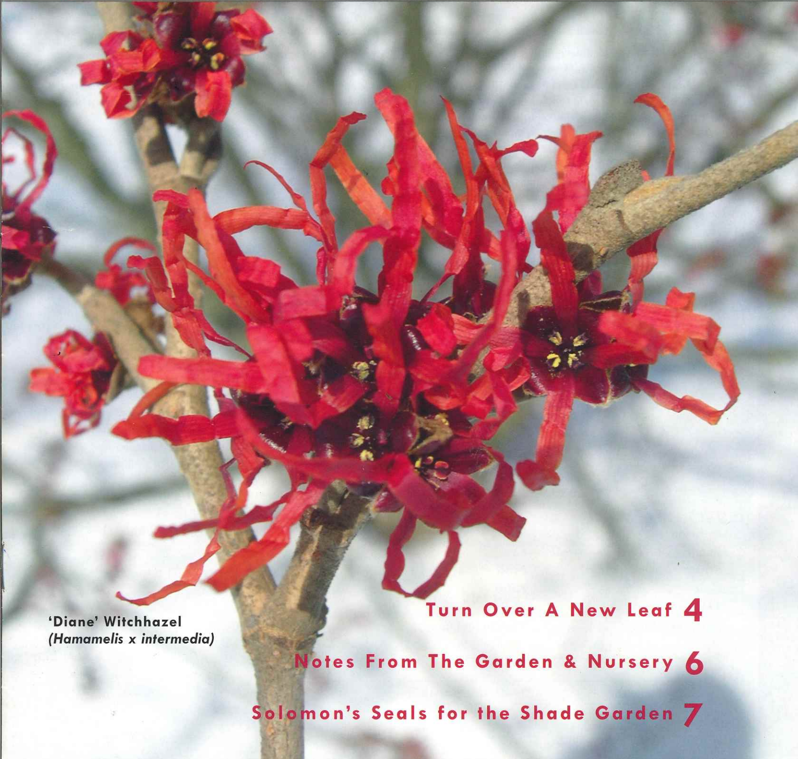
'Diane' Witchhazel ( Hamamelis x intermedia )