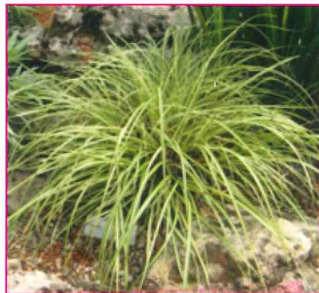
Carex oshimensis EverColor® Series Sedge Selections

Growing to 10-16" tall and wide with arching, grass-like foliage, this series of evergreen sedges can be used in full sun to part shade and both in garden beds and containers. Glossy foliage varies from deep green to gold and variegated forms come in combinations of green, yellow and white providing designers a wide range of options. Highly resistant to deer browse.