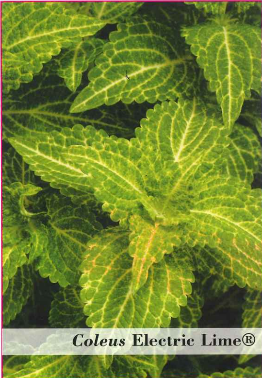
Coleus Electric Lime®

Whether you're a home gardener, landscape pro, died-in-the-wool plant nerd or just interested in picking up a bit of color for the garden, this is the garden event of the season . Featuring more than 450 varieties, this year will be the biggest offering in our history. Starting with a massive list of the thousands of plants we've tested... and done our best to kill... we've put together a collection of the best of the best plants for our region . From new varieties of common garden species to a few we're sure you've never seen before, you'll see everything from annuals and tropicals to herbs, perennials, wildflowers, shrubs and trees. And if it's all a bit overwhelming, no worries. Our top notch staff and volunteers will be on hand to help sort through it all and help make sure you go home with plants that will work.