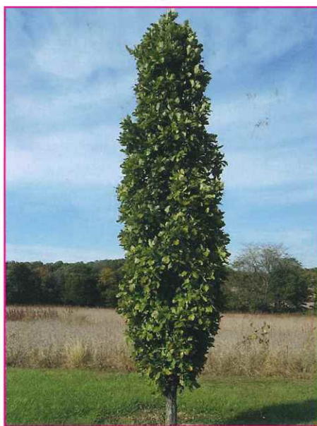
Quercus 'Nadler' Kindred Spirit® Oak

One of the best of the columnar oak hybrids. Growing to 60' tall, this hybrid of English Oak and Swamp White Oak is adaptable to many soils, rapid growing and highly resistant to powdery mildew that bothers some other columnar oaks.