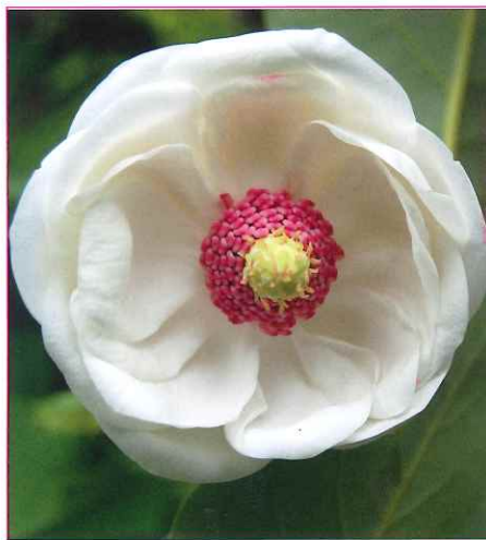
Magnolia sieboldii 'Colossus'

Plan to hit the gardens several times this spring as we fling open the gates for our first Big Bloom! Last fall, a mega crew of staff and volunteers added more than 14,000 bulbs to our already growing show. Masses of daffodils, tulips and a host of others will adorn the grounds whenever they feel in the mood! Check our Facebook page and website home page for bloom progress updates.