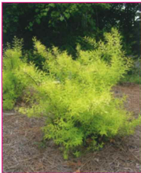
Spiraea thunbergii 'Ogon' Thunberg Spiraea

A gold foliaged spin on a classic shrub. Growing to 5' tall and 6' wide with delicately textured, soft yellow leaves, it works well in full sun to light shade and most soils. Tiny white flowers cover the stems in early spring. Deer resistant.