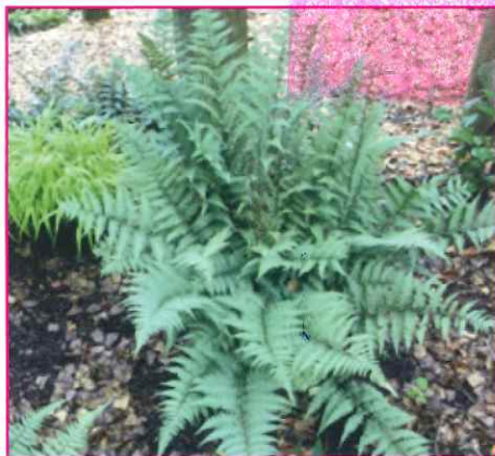
Athyrium hybrid 'Ghost' Lady Fern

A vigorous, clumping fern with gracefully upright arching fronds in a light grey/green. Works best in filtered light to medium shade in any reasonable soil. Works well in the garden as a single specimen or in large masses.