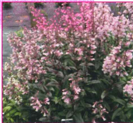
Penstemon hybrid 'Dark Towers' Beardtongue

This burgundy foliaged selection grows to 2-3' tall and bears white blooms on straight, erect stems in summer. It works best in full sun in most soils and is quite drought tolerant. Excellent pollinator plant.