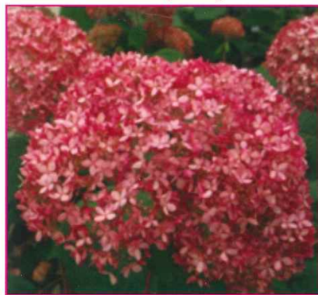
Hydrangea arborescens Invincibelle® Spirit II Smooth Hydrangea

A wonderful, deep pink flowered form of our Kentucky native hydrangea. Flowers on new growth so it blooms even after winter pruning. Excellent 3' tall option for full sun or light shade and most soils.