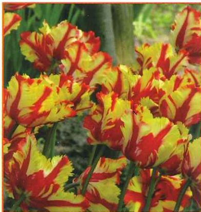
Tulip 'Flaming Parrot'

Place your orders online now at www.yewdellgardens.org and we'll contact you in the fall with pick up dates.