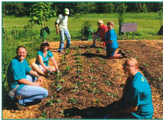
The Oldham County Master Gardeners gang planting the new All America Herbaceous Perennial Trail Beds.