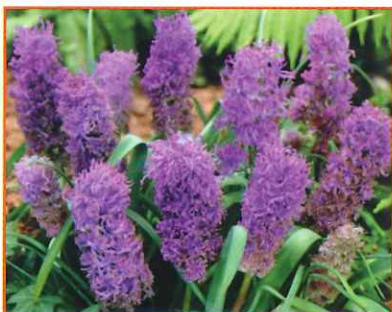
Muscari comosum 'Plumosum' – (Feather Grape Hyacinth)