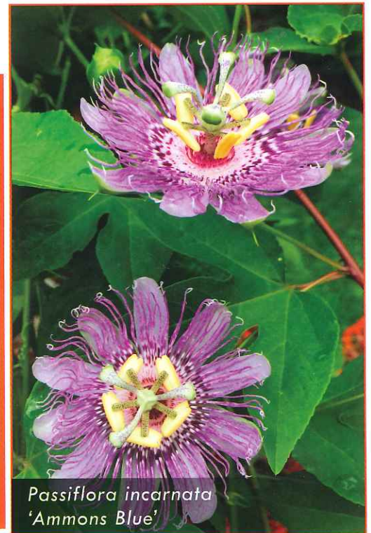
Passiflora incarnata 'Ammons Blue'