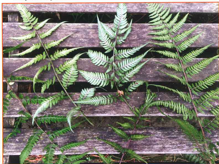
From left to right: Japanese Painted Fern ( Athyrium niponicum ), 'Branford Beauty' var. pictum , 'Wildwood Twist', 'Apple Court' and 'Ghost'