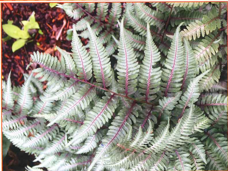
Athyrium niponicum 'Wildwood Twist'