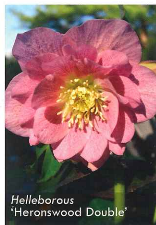
Helleborus 'Heronswood Double'