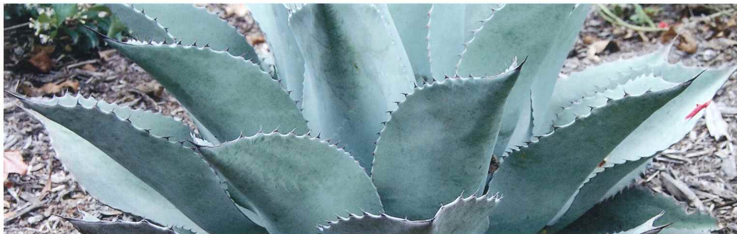
Lotusland in Santa Barbara, CA, known widely for its exquisite Agave collection, is one of the destinations of the Yew Dell southern California garden tour.

Twilight in the Garden is Yew Dell's largest and most important fundraising event of the year, bringing in the funds that support ongoing education programs, family events, plant research and more. Come enjoy a great party and support an outstanding organization as well! Many thanks to our Title Sponsor, Brown-Forman , and our Presenting Sponsors Fastline Publications and Outdoor Lighting Perspectives . Tickets and tables (10) can be purchased on Yew Dell's website or by calling 502-241-4788.