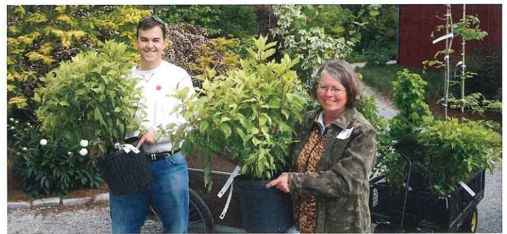
Everyone went home with armloads of stunning plants!