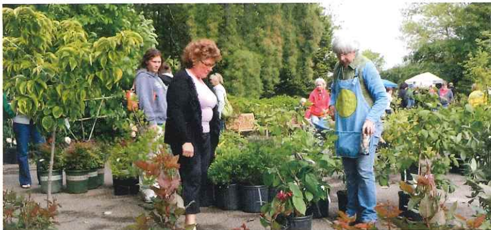
Yew Dell volunteers and staff offer valuable gardening advice to plant shoppers at the 2012 Plant Sale and Garden Market.

The event is scheduled for Saturday, April 27 (10am–4pm) and Sunday, April 28 (noon–3pm) and as always, Yew Dell members get in at 9am Saturday for best selection – so make sure your membership is current and remember to bring your card! Of course memberships will be for sale beginning 9am Saturday! Additional support comes from the Kentucky Nursery and Landscape Association and the Louisville Nursery Association.