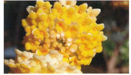
The paper bush ( Edgeworthia chrysantha ) offers spectacularly fragrant golden flowers in March followed by tropical-looking large summer leaves.