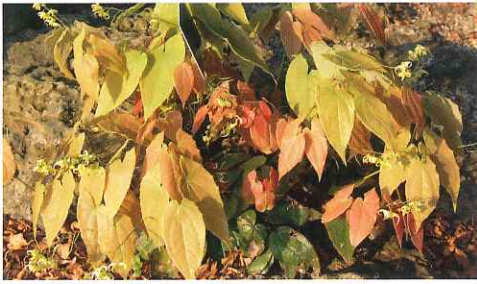
Epimediums make excellent delicate groundcovers for shady locations. ( Epimedium franchettii growing in Yew Dell's Sunken Garden)