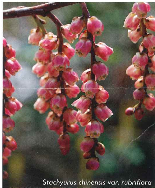
Stachyurus chinensis var. rubriflora