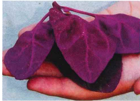
Atriplex hortensis , Red Orach or Mountain Spinach. Lingering rain drops make the gorgeous foliage pop.