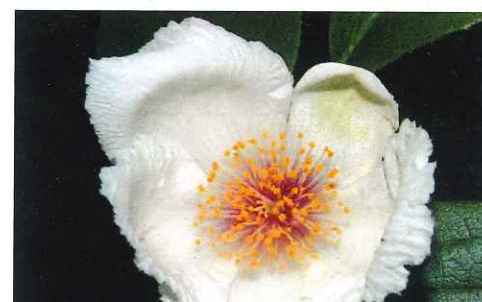
Stewartia ovata (Mountain Camellia) – a relative to tea and garden camellias that is native in southeastern Kentucky.

Stay tuned . . . We hope that one day soon we'll have some new garden introductions to share from this exciting seed collecting work!