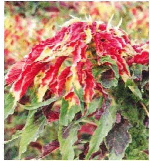
Amaranthus tricolor 'Perfecta' or Callaloo. The colorful variegated leaves stand out in any garden.

I am up to my elbows in plant catalogs and that's just fine by me! In my opinion, one can never have too many and I'm enjoying the chance to pour through the pages from some of my favorite vegetable seed companies. As I flip from one catalog to the next, I am reminded of some very cool plants that I grew in the past and that would be absolutely spectacular additions to this year's Jurassic Garden.