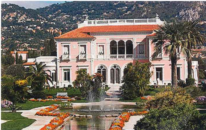
Gardens of the Villa Ephrussi Rothschild. The Villa is surrounded by nine magnificent gardens offering patios, waterfalls, ponds, herbaceous borders, shady paths and rare trees.