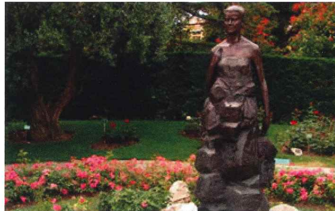
The Princess Grace Rose Garden exhibits over 150 types of roses from all over the world.