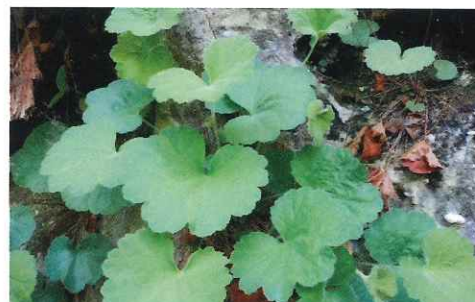
The typical green-leaved form of Heuchera parviflora in McCreary County, Kentucky. Yew Dell staff are working on developing new forms for the garden market.

Heuchera parviflora – Here's one even we never heard of before this work! This relative of the common garden coral bells is almost completely absent from cultivation. It grows in extremely dry and darkly shaded areas, is highly tolerant of high heat and humidity (unlike so many of the modern cultivars!) and offers rounded bright green leaves and tiny white flowers over a long period in late summer/fall. The exciting bit is that we've found a few populations that have brilliant purple leaves even in dark shade!