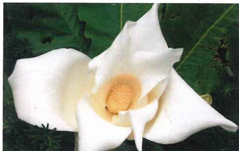
Magnolia macrophylla (bigleaf magnolia) offers the largest simple leaf of any tree in the US. It is a first-rate garden plant with enormous creamy white flowers in late May.

Magnolia macrophylla – The aptly named Bigleaf Magnolia is a wonder of the Kentucky woods. Its 3' long leaves resemble those of a banana plant and offer a tropical rainforest feel to both woods and gardens. The late spring flowers are absolutely enormous - creamy white display stretching up to a foot in diameter! This species is found only in the southeastern US with particularly broad distribution in southeast Kentucky. It makes a first rate garden plant anywhere in our region as long as it is given reasonable soil moisture through the summer.