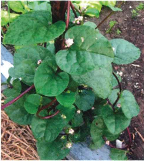
Basella alba 'Rubra', Malabar Spinach. A showstopper in the garden!