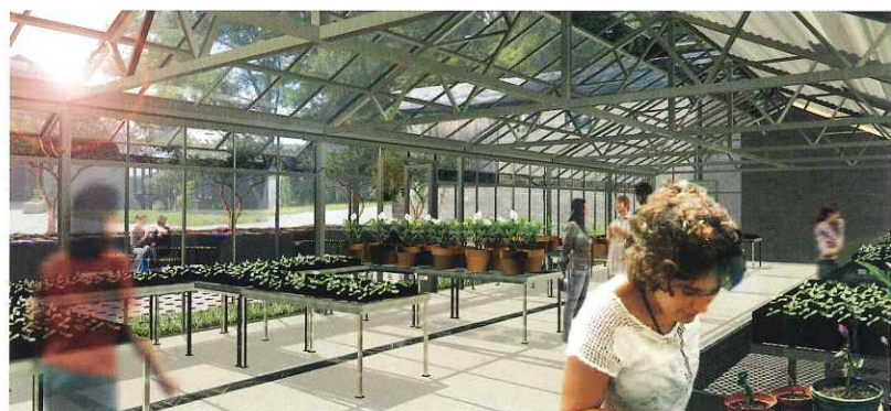
Architect's rendering of the new greenhouse interior.