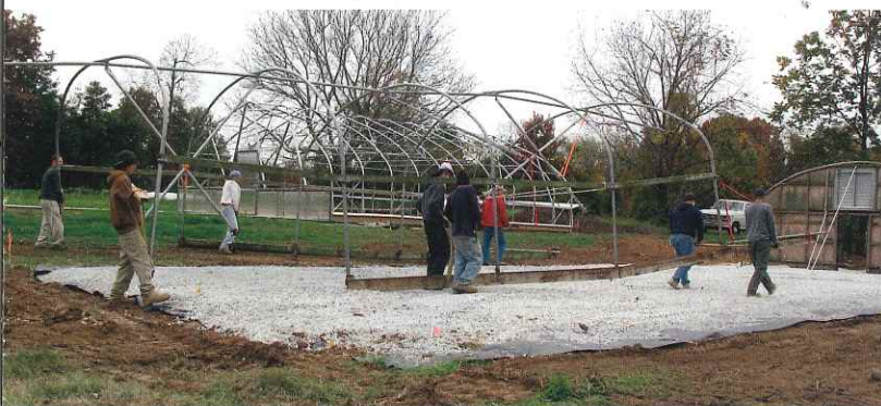
Kiel Thomson Company workers and Yew Dell volunteers literally picked up and carried away the old hoop house to make room for greenhouse construction.

You've been hearing about it and we're now delighted to announce that we are officially under construction! The new horticulture facilities that have been planned and talked about for more than a year are beginning to materialize. When completed, they will create a one-of-a-kind facility that will greatly enhance our research, education, production and outreach work. And if you want to be part of this historic effort, now's the time to get involved.